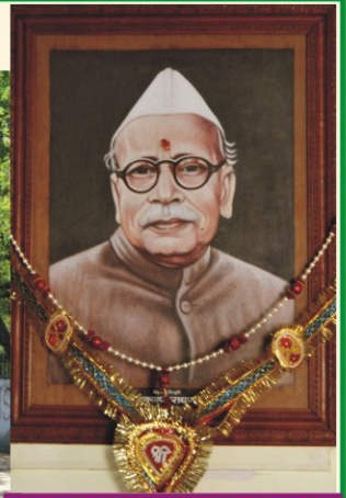
Bihar Vibhuti Dr. A. N. Sinha