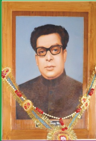
Founder of A. M. College, Gaya