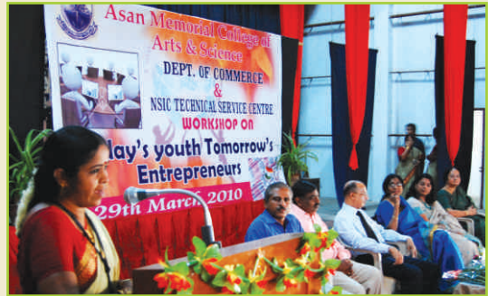
WORKSHOP IN ENTREPRENEURSHIP