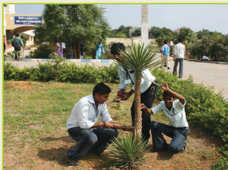
NSS CAMP AT MEDAVAKKAM