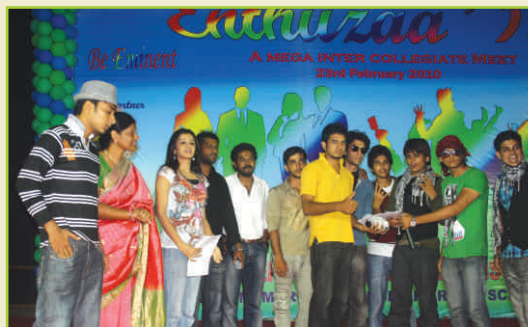
INTER-COLLEGIATE MANAGEMENT MEET