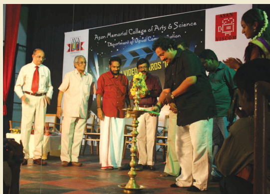
ASAN VIDEO AWARDS 2010