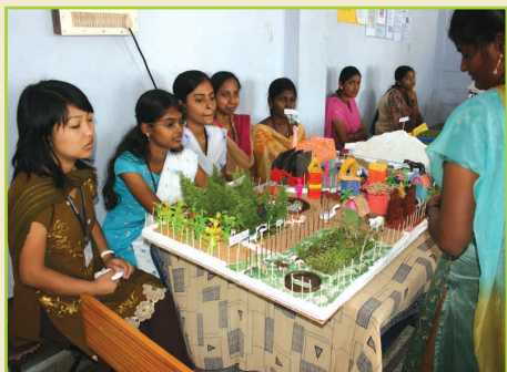
SCIENCE EXHIBITION - 2010