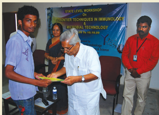
STATE LEVEL WORKSHOP IN MICROBIOLOGY