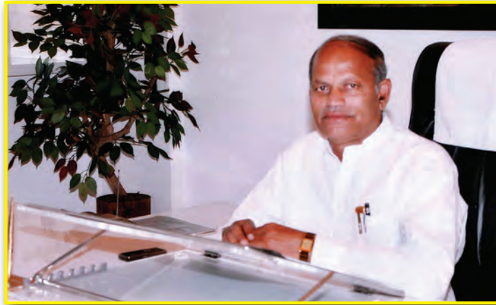
Hon'ble Shri. Narendrabhau Bhikaji Darade