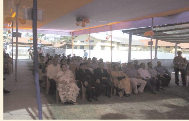
2 nd Foundation Day Celebration on 15-11-2013