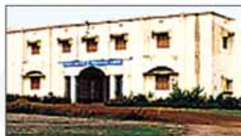
Seemanta Institutes of Pharmaceutical Sciences (B.Pharm) Estd. 1992