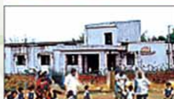
Seemanta English Medium School Estd. 2000