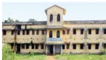
Seemanta Institutes of Pharmaceutical Sciences (D.Pharm) Estd. 1982