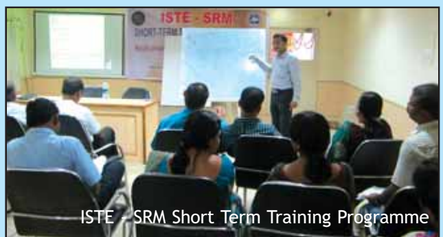
ISTE - SRM Short Term Training Programme