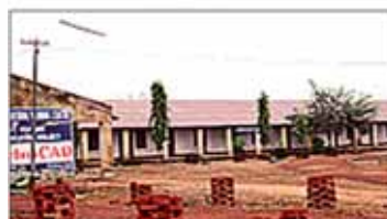
Seemanta I.T.I. Estd. 1992