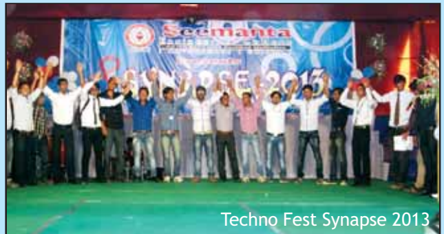
Techno Fest Synapse 2013