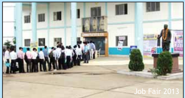
Job Fair 2013