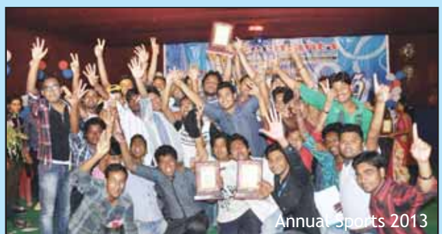
Annual Sports 2013