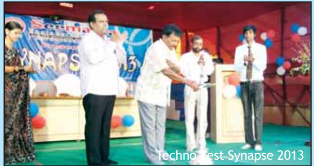
Techno Fest Synapse 2013