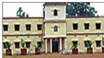
Seemanta Mahavidyalaya Estd. 1979