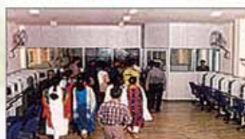
Seemanta MCA Estd. 1999