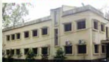
Seemanta Institutes of Pharmaceutical Sciences (M.Pharm) Estd. 2002