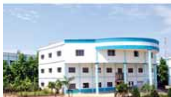
Seemanta Engineering College Estd. 1997