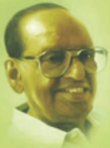
DC Kizhakemuri (1914-1999) Recipient of Padma Bhushan Founder DC Group