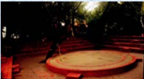
Chaupal: The Amphitheatre