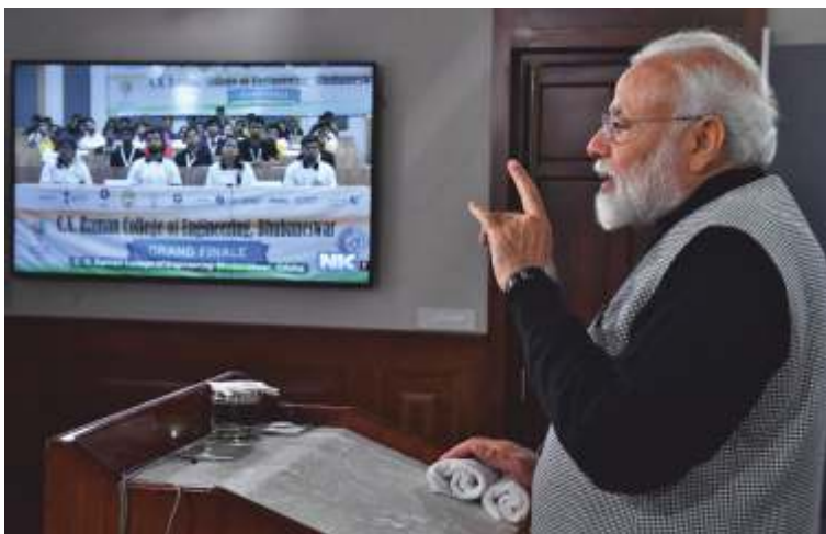
The winners interacting with Hon' Prime Minister Sh. Narendra Modi.

Winners of Smart India Hackathon- 2019 (A national event of MHRD).