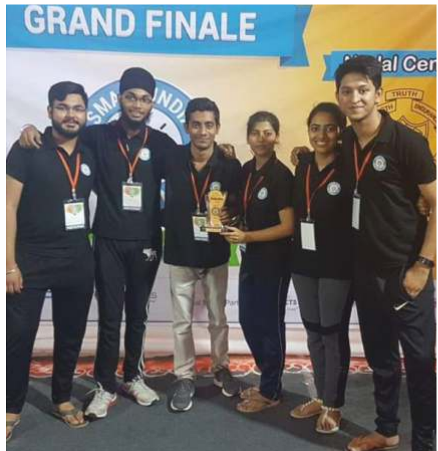
Deloitte Innovation Award Winners During Smart India Hackthon 2018