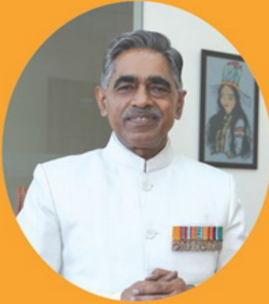
PhD., MPhil, MMS, MSc Vice- Chancellor, Mangalayatan University Jabalpur

“Knowledge is Power” said Bharat Ratna, Abdul Kalam