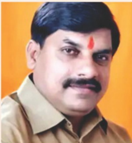
Shri Mohan Yadav Education Minister, State of Madhya Pradesh